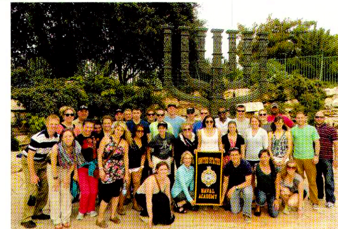
Israeli Knesset Menorah