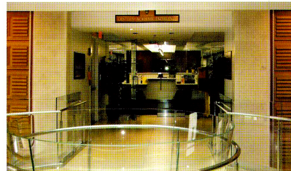
Center for Academic Excellence