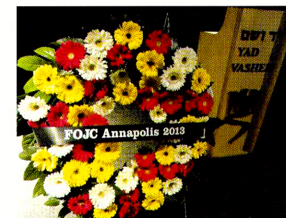
Wreath at Yad Vashem - Jerusalem

326 FIRST STREET, SUITE 22 | ANNAPOLIS, MD 21403 A building of spirit...a building of strength