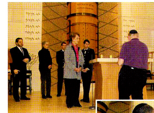
Representatives from area congregations, USNA midshipmen and St. John's College light the candles of remembrance.