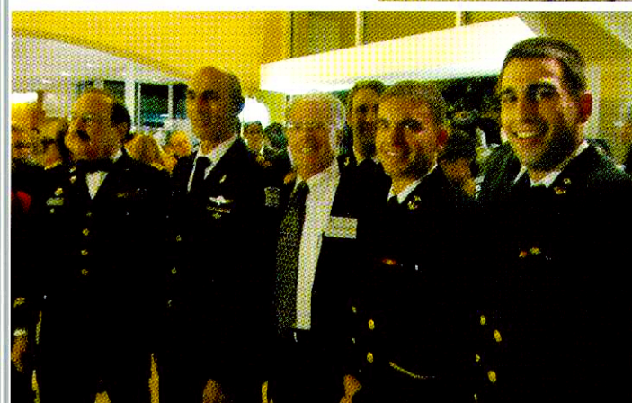
Friends of the Israel Defense Force Gala in Baltimore