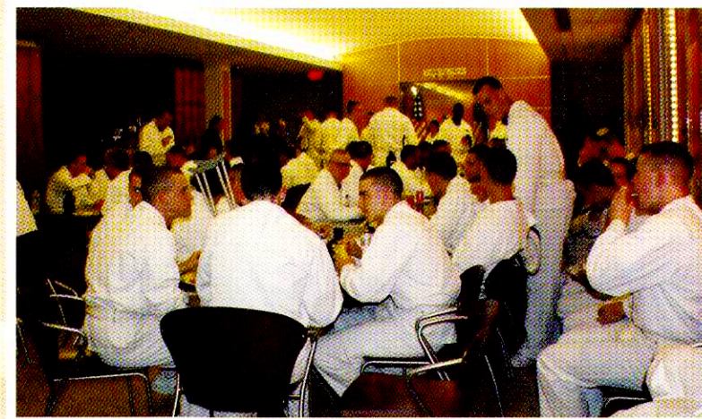
Family & friends at the Eve of Rosh Hashana dinner