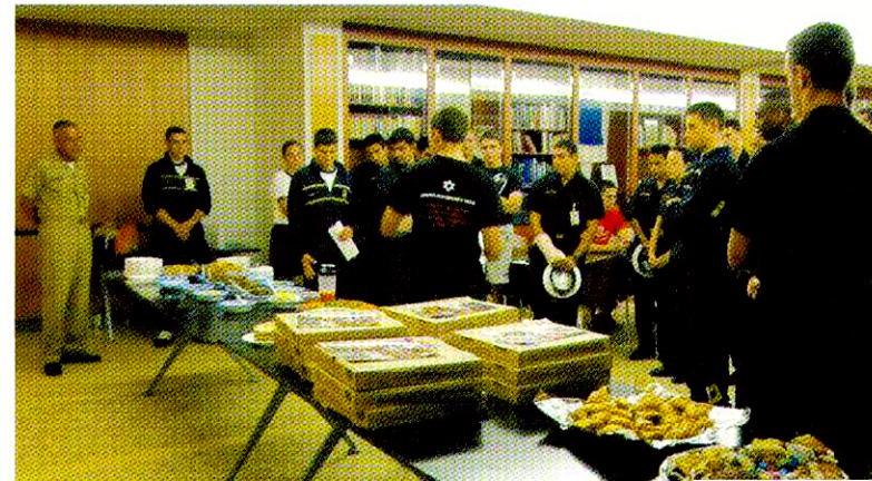
Joint meeting of the Jewish Midshipmen's Club and Muslim Midshipmen's Club

A welcoming place...as stated by the many plebes who attended the Jewish services and stayed for the Oneg