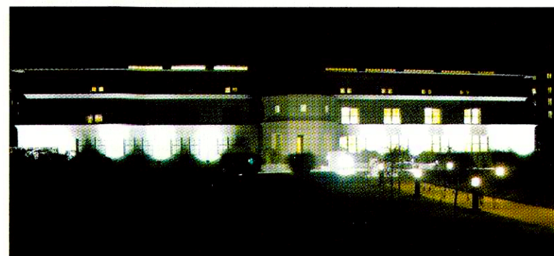
Levy Center at Night