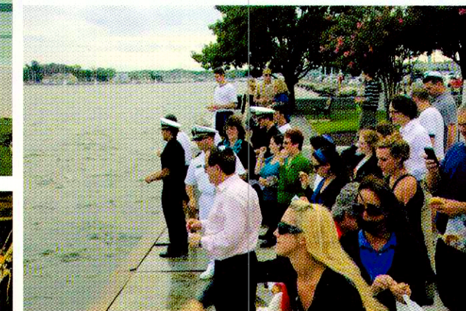
Midshipmen, friends and family tossing their sins on the water during Tashlich.